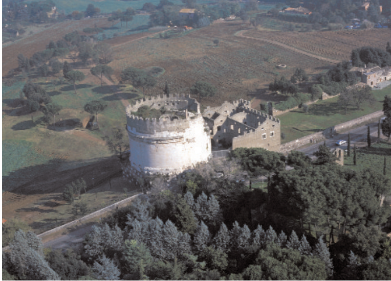
The tomb of Caecilia Metella on the Appian Way